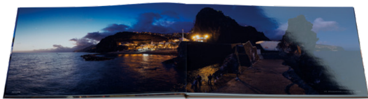
Photo albums in various sizes and outstanding thickness