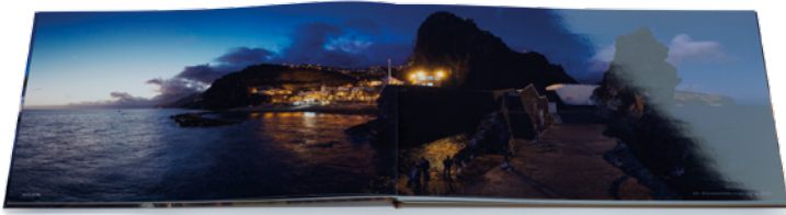
Photo albums in various sizes and outstanding thickness