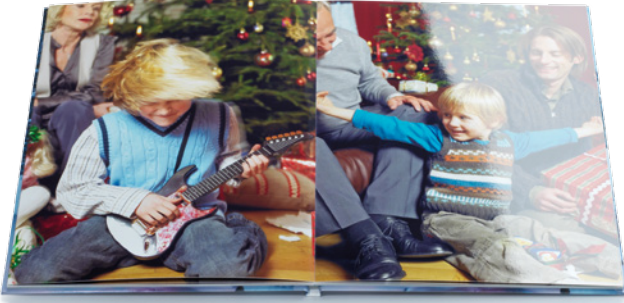
Photo albums in various sizes and outstanding thickness