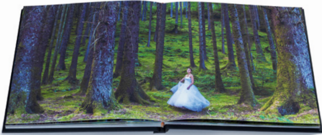
Photo albums in various sizes and outstanding thickness