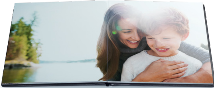
Photo albums in various sizes and outstanding thickness