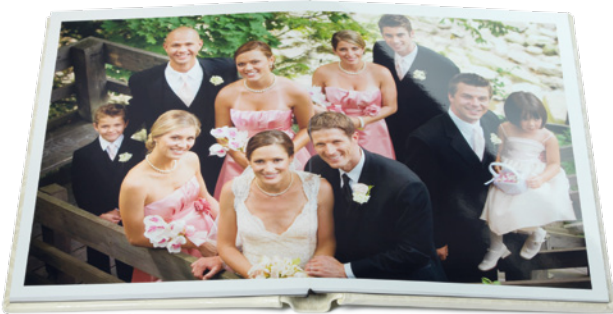
Photo albums in various sizes and outstanding thickness